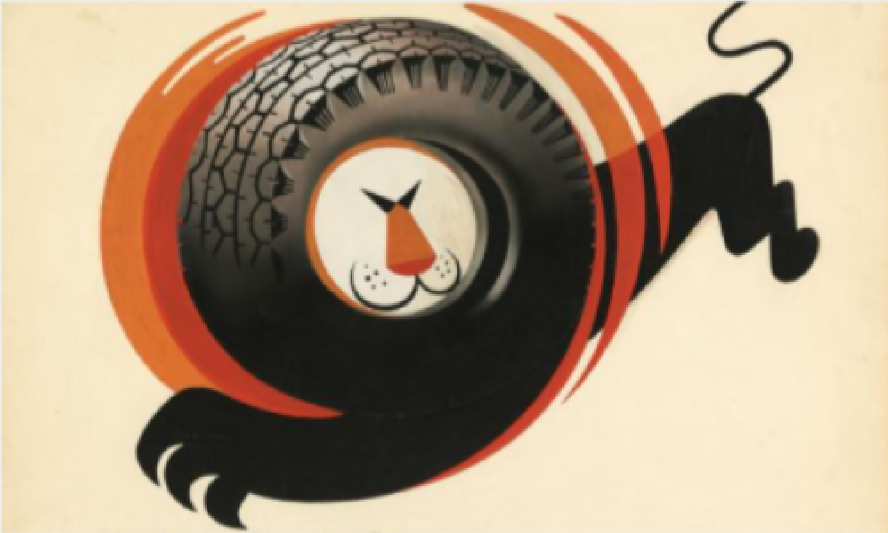
Advertisement for the Pirelli Stelvio tyre