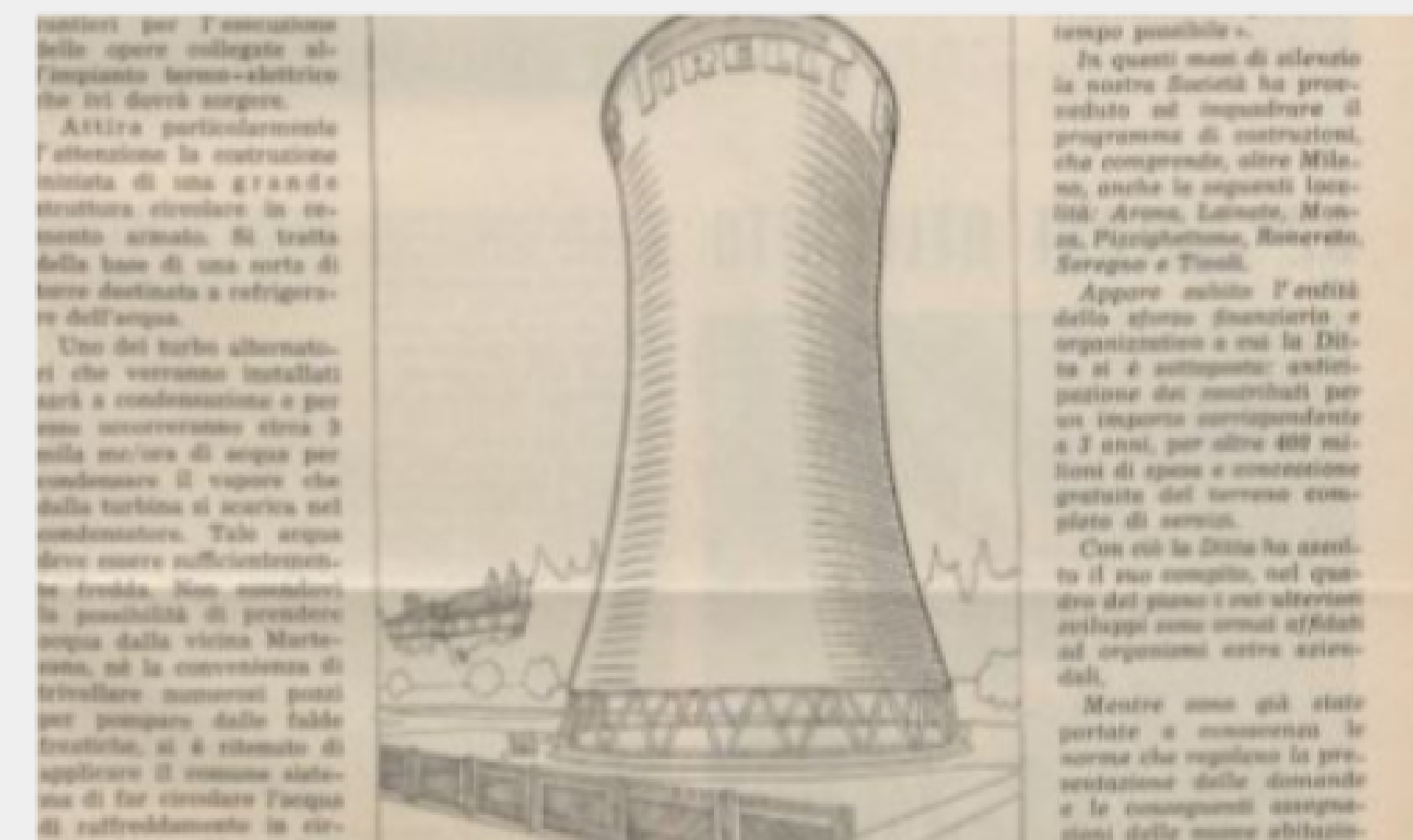
The cooling tower