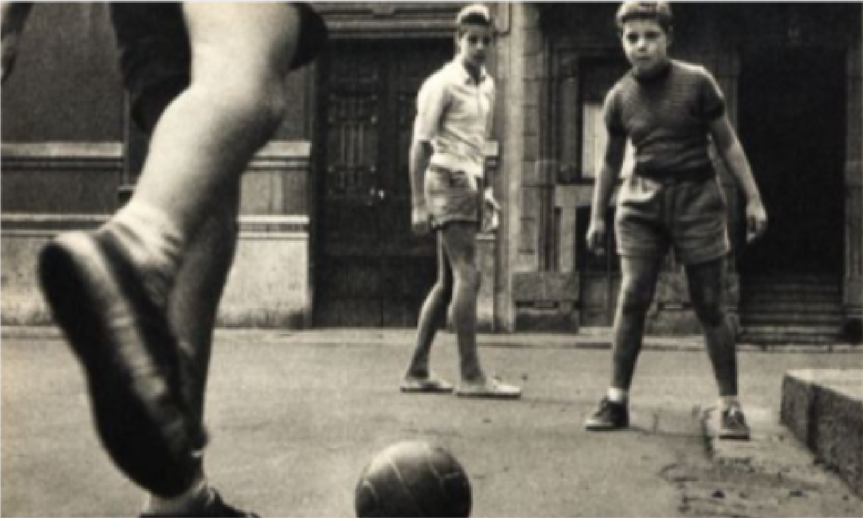
Rubber in the Home