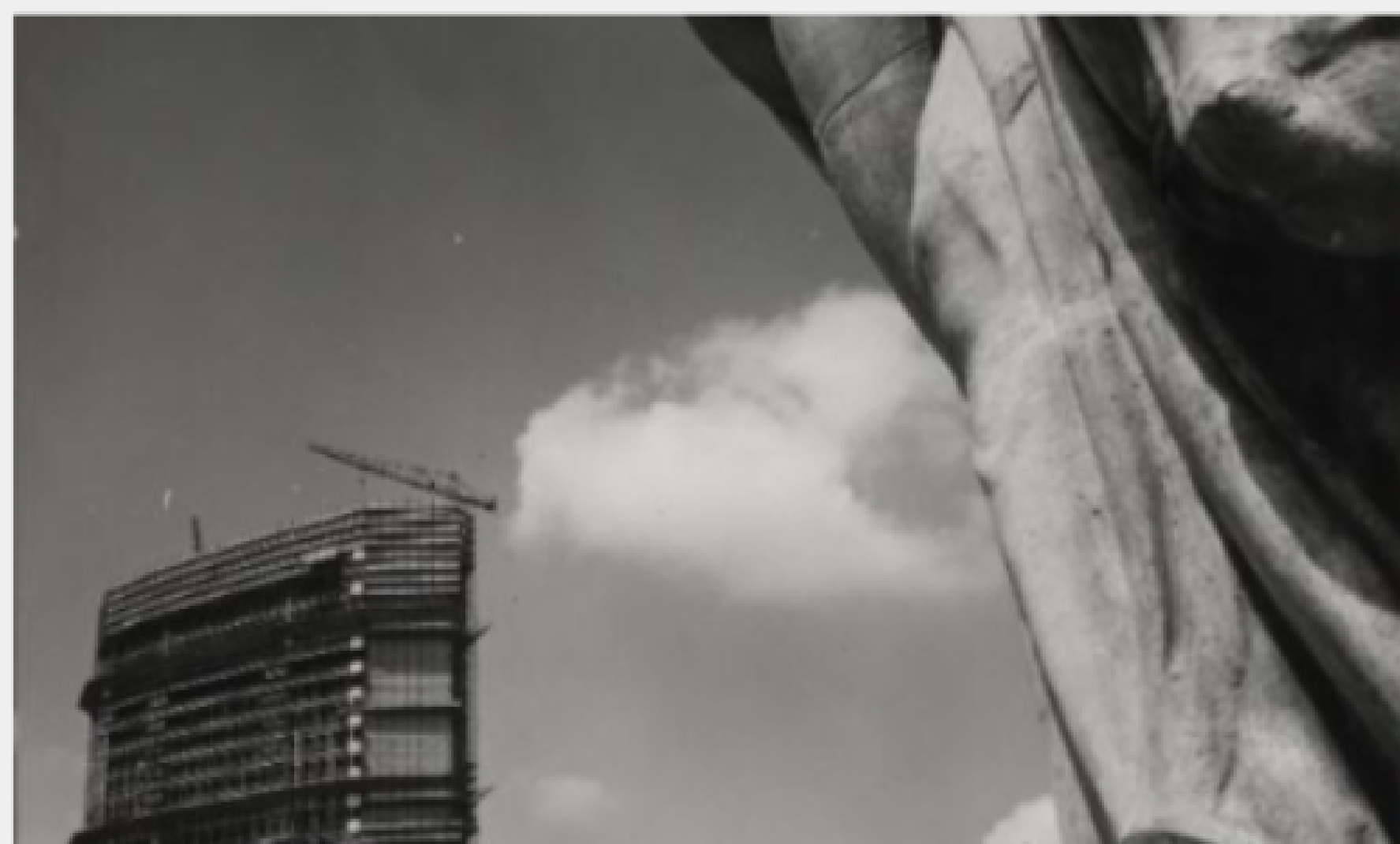
Building the Pirelli Tower

A look at some of the subjects and documents selected for this course