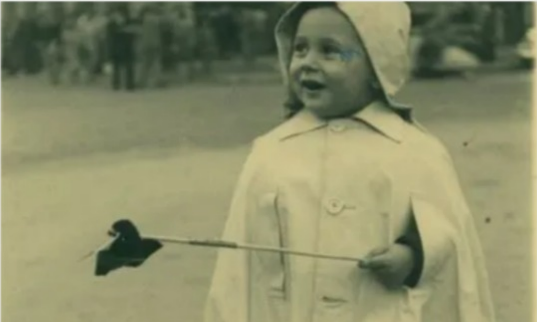
Waterproofs for children