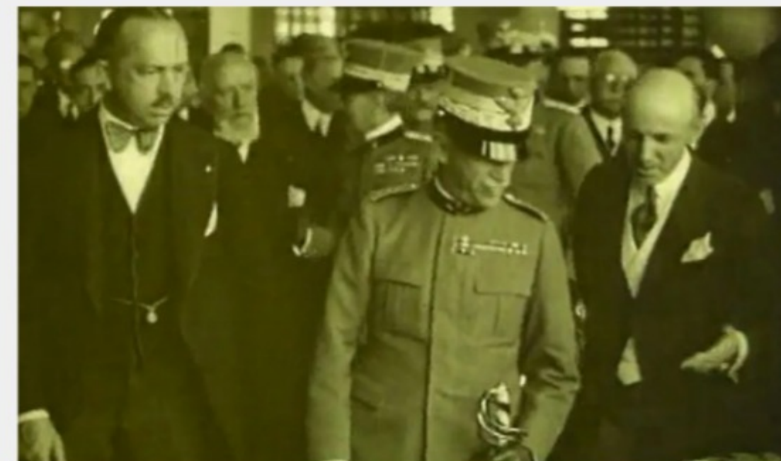
Visit by King Victor Emmanuel III to Bicocca