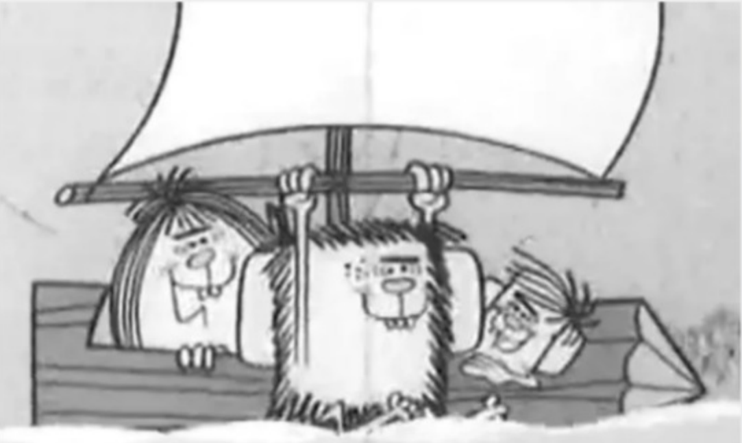
Mammut, Babbut and Figliut at the Olympics

A look at some of the subjects and documents selected for this course