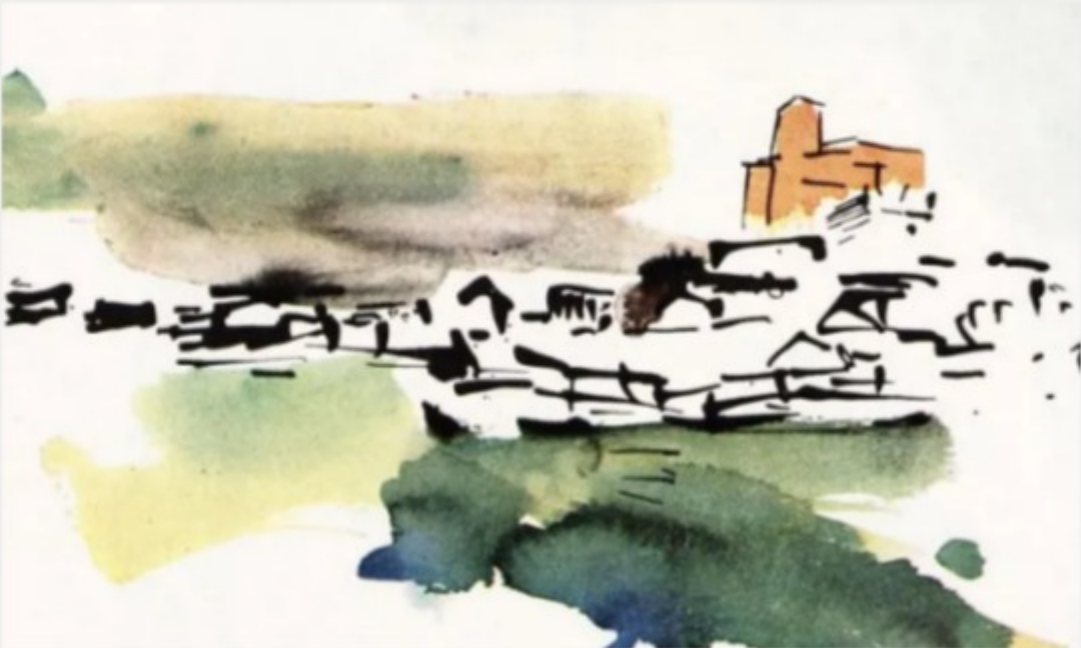
Illustrated travel itineraries