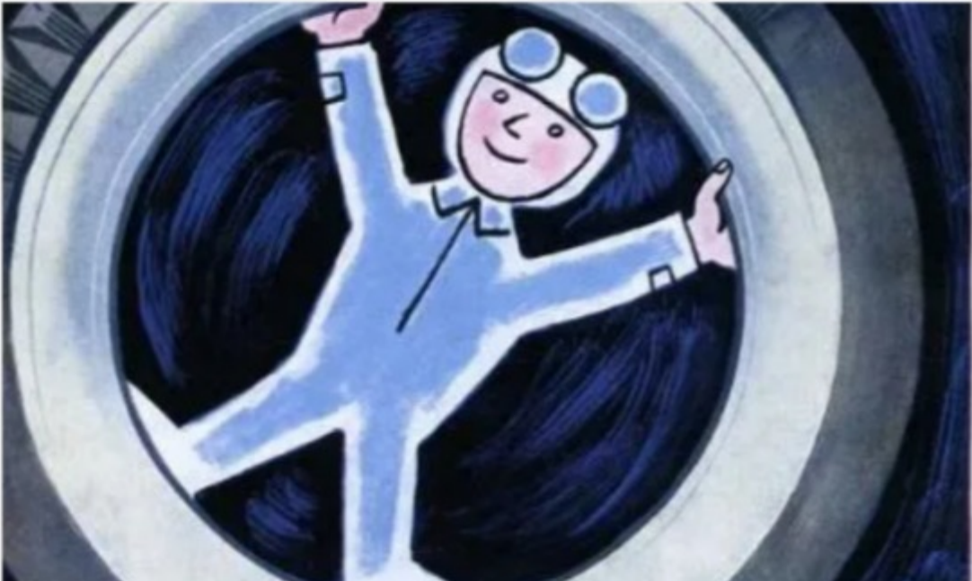
Advertisement for the Pirelli Stelvio tyre