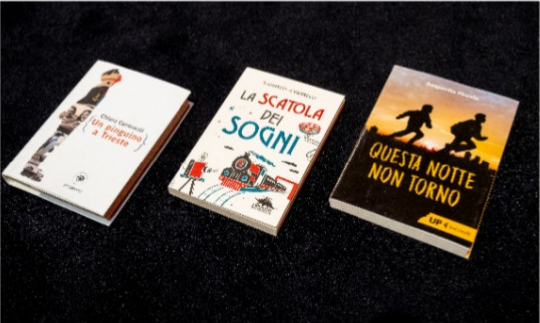
Premio Campiello Junior 2022

A look at some of the subjects and documents selected for this course