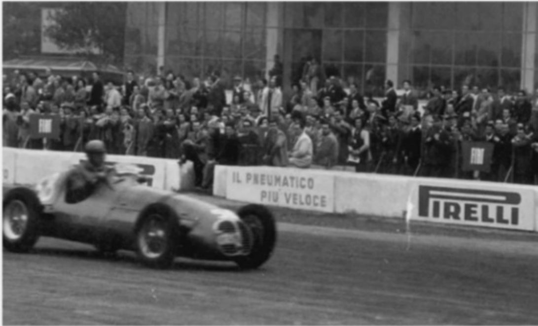
Pirelli, stories of races