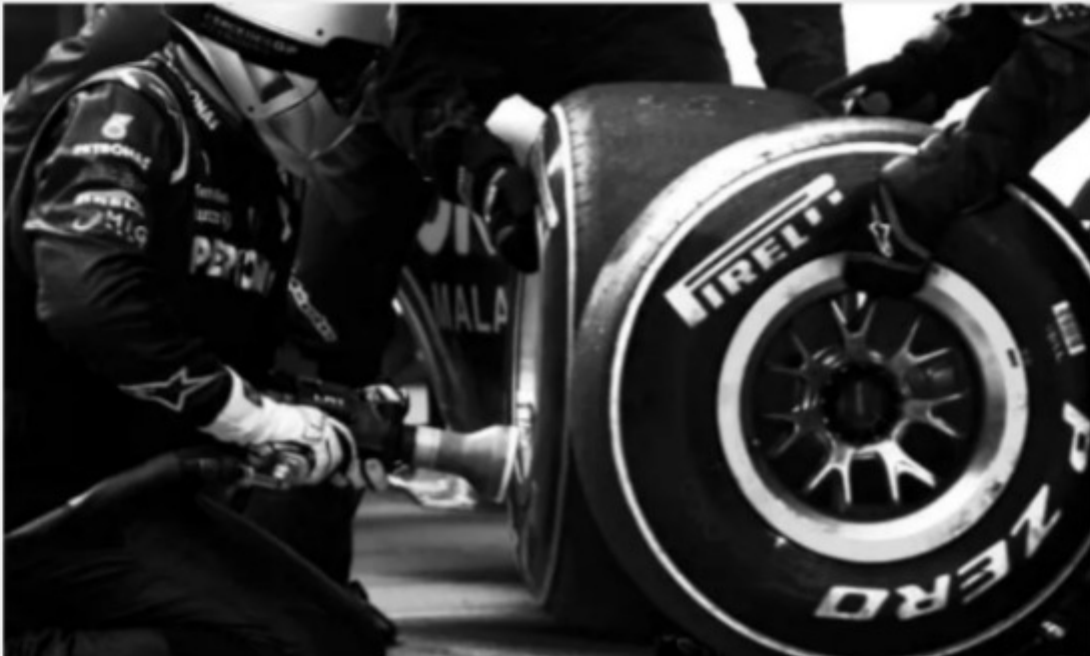
Pirelli, When History Builds the Future