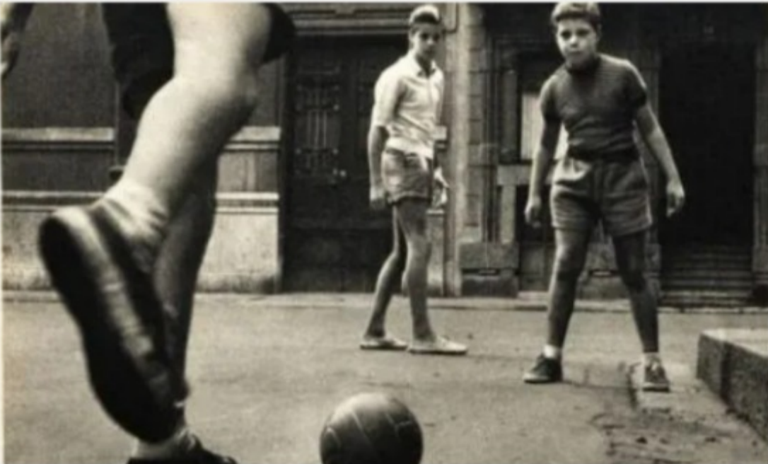
"La gomma nella casa" by Federico Patellani

A look at some of the subjects and documents selected for this course