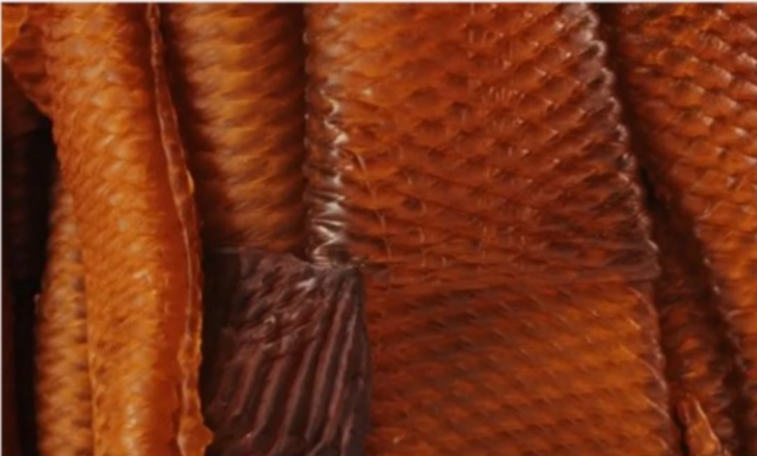
Shapes, patterns, movements and colours