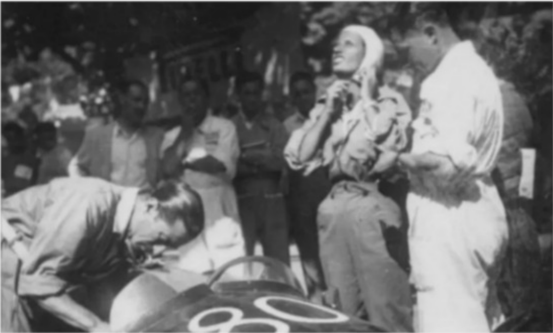
Podcast - Women Drivers: Racing with Pirelli