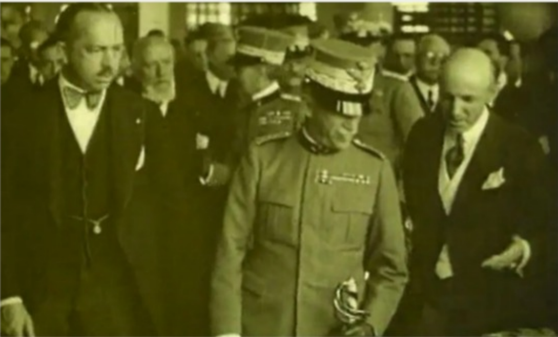
Visit by King Victor Emmanuel III to Bicocca