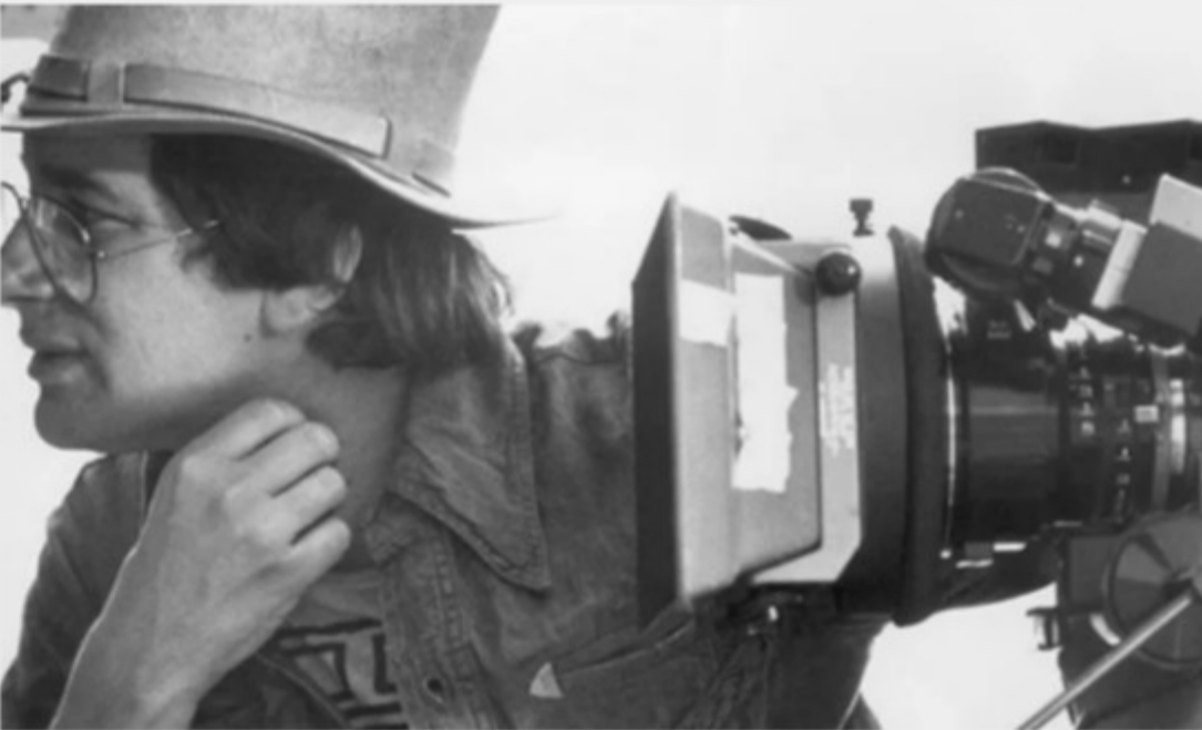
The future of cinema, according to Steven Spielberg