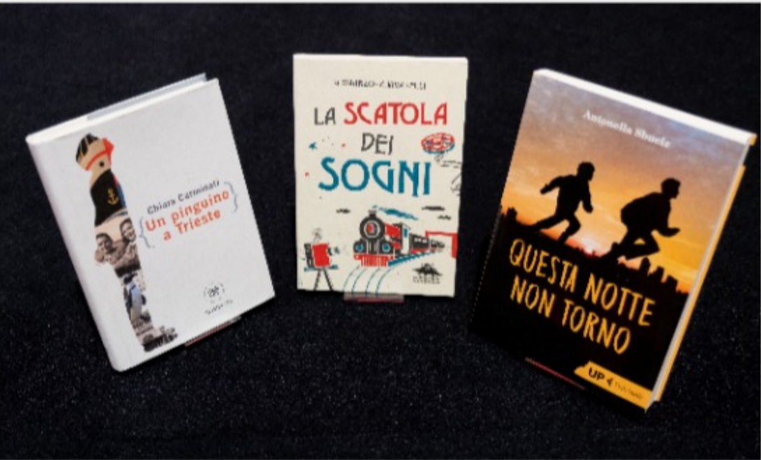
Premio Campiello Junior 2022

A look at some of the subjects and documents selected for this course