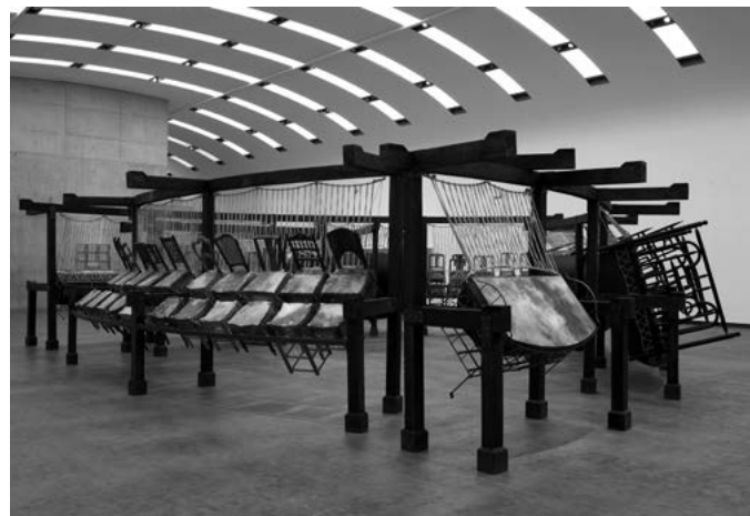
Jue Chang, Dancing Body – Drumming Mind (The Last Song), 2000 Beds, chairs, cowhide, wood, metal, string, rope 244 x 1800 x 1400 cm

The monumental installation is composed of beds, chairs and stools whose surfaces are covered in cowhide. The complex composition, which suggests a large percussion instrument, spans through an area measuring 18 x 14 meters. Created by Chen Zhen using elements from different places and contexts, it forms what he called a “relational installation” expressing his interest in the transformation processes that underlie the relations between both objects and people. Connected to the care we take of our body and spirit, Jue Chang, Dancing Body – Drumming Mind (The Last Song) can be activated by dancers who brush their hands across and drum on the leather surfaces, resembling the movements used in Chinese massage.