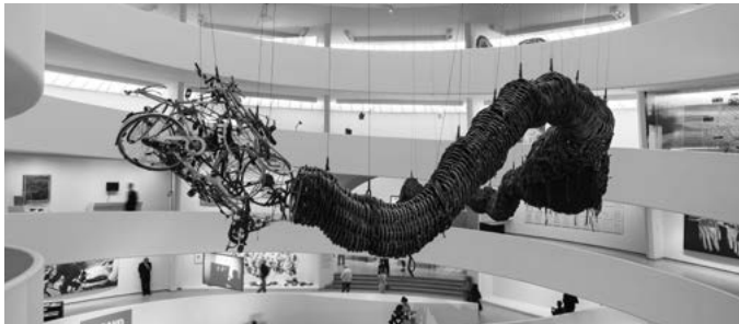
Precipitous Parturition , 1999 Installation view, Solomon R. Guggenheim Museum, New York, 2018

and inner tubes, reminds of a 20-meter-long dragon, whose belly is covered with black plastic toy cars. As with other installations, in Precipitous Parturition the artist uses physical and bodily processes as a metaphor for historical change: the transformation of Chinese industry, which has made a strong surge towards creating a global economy, leaving behind its traditional craft production. Like this installation, which demonstrates the artist's strong sensitivity to the formal aspect and physical dimension of the artwork, Chen Zhen's works touch on profound aspects linked to humanity and the contradictions of contemporary society's values.