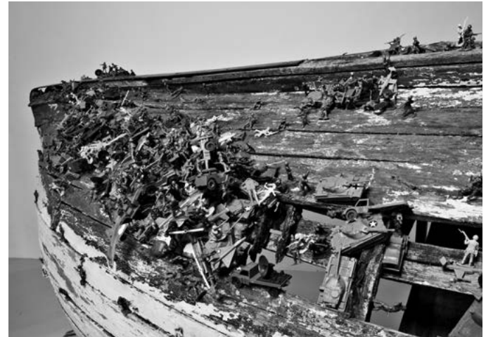
Six Roots Enfance / Garçon – Childhood / Boy , 2000 (detail) Wooden boat, plastic toy soldiers and tanks, metal 173 × 382 × 150 cm

This work is part of a more complex work of 7 installations that represent 6 allegories. The first part of its title derives from the Buddhist expression "six roots," which indicates the body's sensory abilities: sight, hearing, smell, taste, touch, and knowledge. These skills of perception provide Chen Zhen with a cue to create a metaphor for the different attitudes and temperaments that the individual develops in the phases of life—birth, childhood, conflict, suffering, memory, death, and rebirth—thus investigating some of the contradictory aspects of the human spirit. In particular, to symbolize childhood and youth the artist features the wreck of a boat, overturned and suspended, covered with plastic toy soldiers suggestive of the marine encrustations that form on boat hulls.