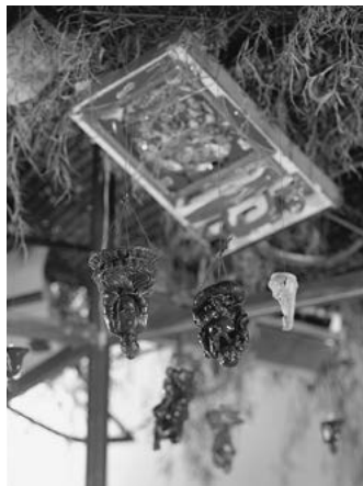
Fu Dao / Fu Dao, Upside-down Buddha / Arrival at Good Fortune, 1997 (detail) Metal, bamboo, Buddha statues, found objects 500 x 800 x 650 cm approx.

“Short-circuits” is conceived as an immersive exploration of Chen Zhen’s artistic research and brings together more than 20 large installations realized between 1991 and 2000. The exhibition presents works created by assembling everyday objects, like beds, chairs, newspapers and clothes, with assorted materials, such as wood, clay, water, fabrics and glass, thereby displaying Chen Zhen’s personal vision of the human experience in all its complexity.