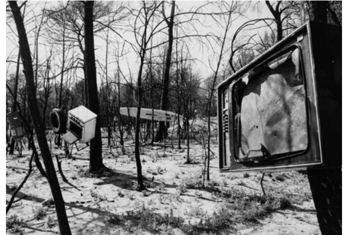
Un monde accroché / détaché , 1990 Found objects 1000 m 2 approx. Installation view, Pourrières, 1990

Chen Zhen's oeuvre was marked by his personal suffering from an autoimmune disease: at 25 he was diagnosed with a form of hemolytic anemia. Struck by the news, he spent three months in Tibet sharing with monks a simple