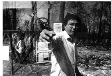
Chen Zhen in Pourrières, 1990

Chen Zhen (Shanghai, 1955 – Paris, 2000) is one of the major figures of the art scene to have overcome the diversity between Eastern and Western aesthetics since the late 1980s, influencing an entire generation of artists. Born in Shanghai in the mid-1950s, he was raised in a family of doctors living in the city's French Concession neighborhood during the Cultural Revolution in China. Chen Zhen graduated with a bachelor's degree from the Shanghai School of Fine Arts and Crafts in 1973 and, few years later, in 1978, studied at the Shanghai Drama Institute where he specialized in set design and became a lecturer in 1982.